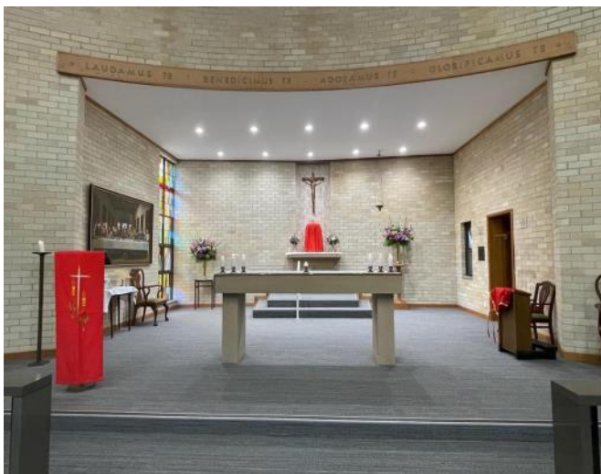
Left: The interior of the Southern Cross Care Chapel